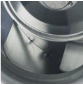
Backward curved centrifugal impellers To prevent accumulation of dirt.