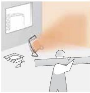
Drying applications in building works